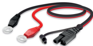
Cable with rings \varnothing 6mm IP65