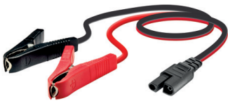
Cable with clamps 30A